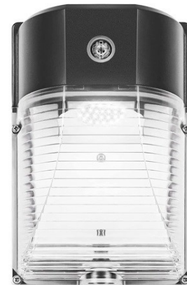
CINETON 26W LED Wall Pack Light with Dusk to Dawn Sensor, 3000LM/100-277Vac/160W HID/HPS Equiv. | IP65 Waterproof Outdoor Security Flood Lighting for Garage...