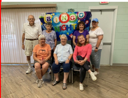
AUGUST BINGO WINNERS